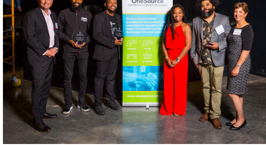
Nonprofit Community Partners Cincinnati Music Accelerator Revolution Dance Theatre PAR-Projects