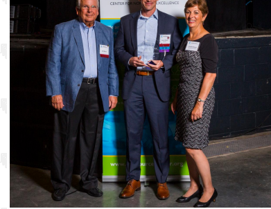
Corporate Community Partner Deloitte