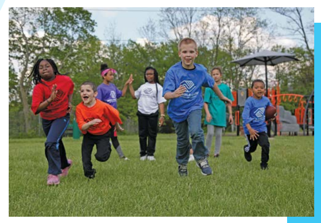
The Boys & Girls Clubs of Greater Cincinnati is a premier youth development agency that changes lives and builds great futures for kids offering a free, safe after-school environment with enrichment programming.