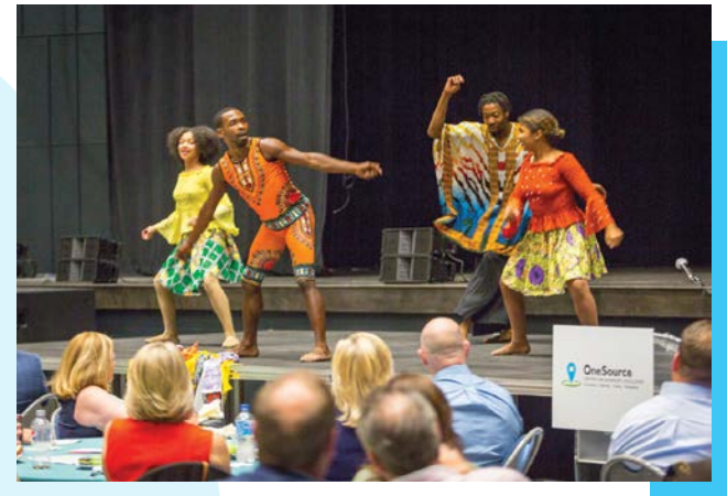
Revolution Dance Theatre is a nonprofit dedicated to building cultural diversity in the world of dance. Troupe members are shown performing at OneSource Center's 2021 "Celebration of Partners" event on the stage they obtained through our connections.

OneSource Center, the only resource center for nonprofits in the region, strengthens and supports leaders and their organizations, enhancing their capacity for greater impact in the community.