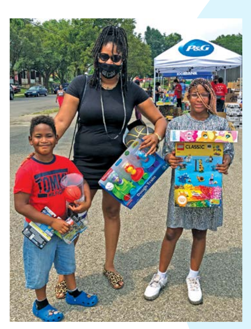
Smiles abounded because of OneSource Center's lead in organizing our region's portion of the national "Unplug and Play" free toy distribution.

OneSource Center partnered again with the Reds Community Fund, Children's Hospital, the Cincinnati Zoo, Procter & Gamble, the Cincinnati Toolbank and others on this far-reaching community enhancing event. Several Avondale schools and parks benefitted. OneSource Center's furniture and Marketplace items were utilized in the renovation/refresh of Taft Boys and Girls Club's Teen Room, classrooms, staff offices, and in the Crest Smile Shoppe located next door.