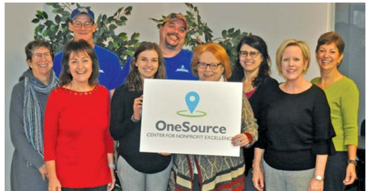
The OneSource Center staff (including the two missing staff members) thanks all supporters working with us to build a thriving community for all!