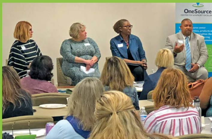
Industry experts and consultants donate thousands of hours annually to multiple OneSource Center leadership development opportunities.