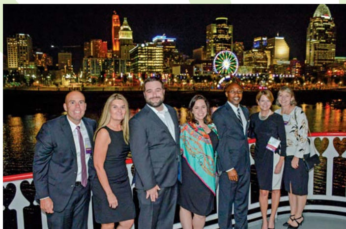
The highlight of the evening was the illumination of Cincinnati, Northern Kentucky and the Roebling Bridge for BLINK®. Standard Textile team members, pictured above, accepted the Corporate Community Partner Award for all employees of the organization.