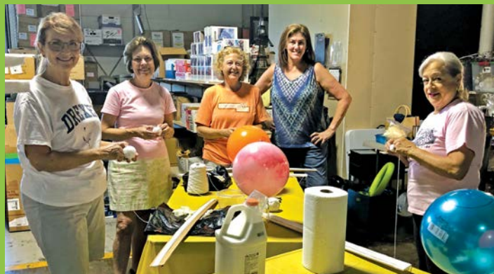
Volunteer teams worked tirelessly behind the scenes for the recent "Illuminate the Night" event.

It doesn't take an expert to understand that quality support is worth its weight in gold. At OneSource Center we don't take one sponsor, one donation, one volunteer, one trainer or coach, one board member or one consultant for granted. Without you, the important belief we have at OneSource Center that high-performing nonprofits are vital to a thriving Greater Cincinnati community, would be for naught. Following are just some examples of the many people that represent our organization in the community and work with us in supporting nonprofits!