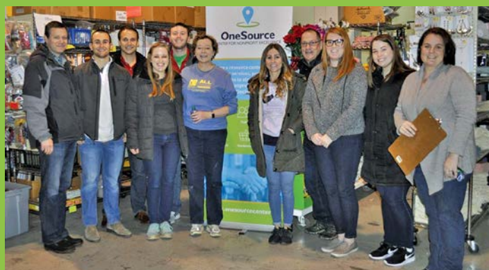
Sponsor BKD CPAs and Advisors assisted with OneSource Center's year-end inventory.